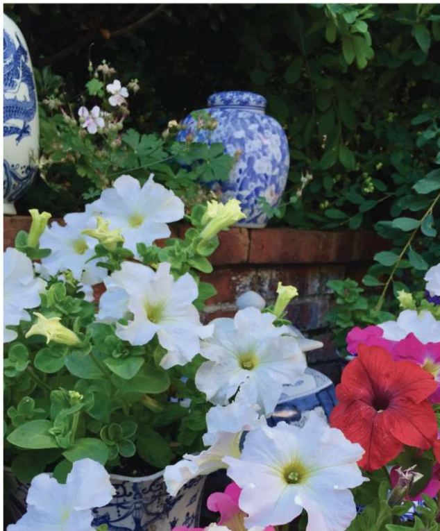
Blue urns are highlighted by white and red petunias.