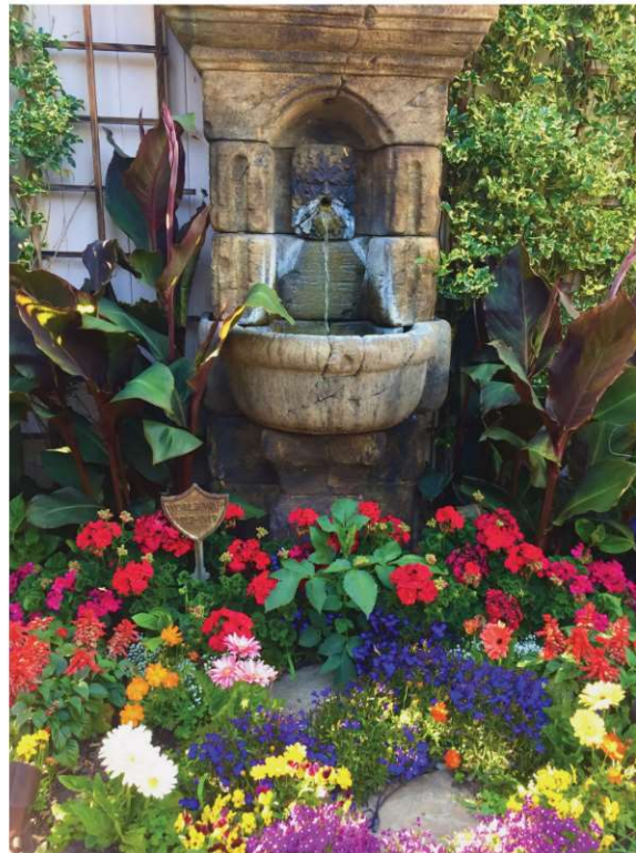
A mixed border garden with a gurgling wall fountain.