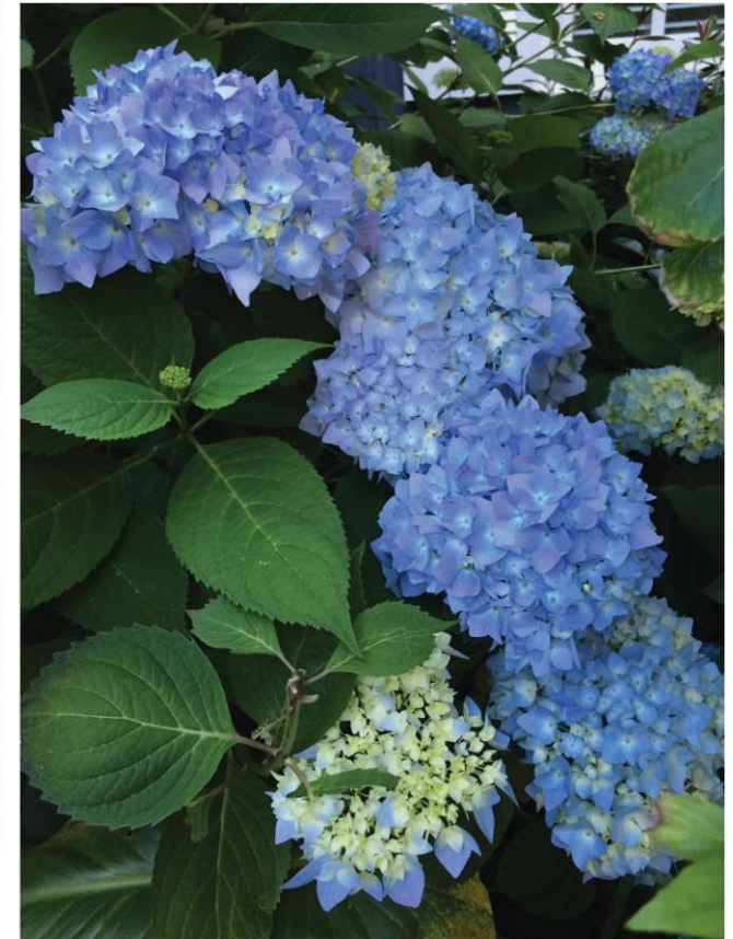
Blue hydrangeas make a statement in the garden or a bouquet.